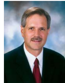
Governor John Hoeven

North Dakota's state employees are the best in the nation, providing quality services and ensuring the successful and efficient operation of our state. We are proud of the work state employees do for our citizens and pleased to be able to compen-