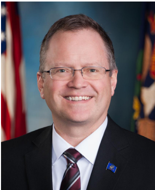
LT. GOVERNOR BRENT SANFORD