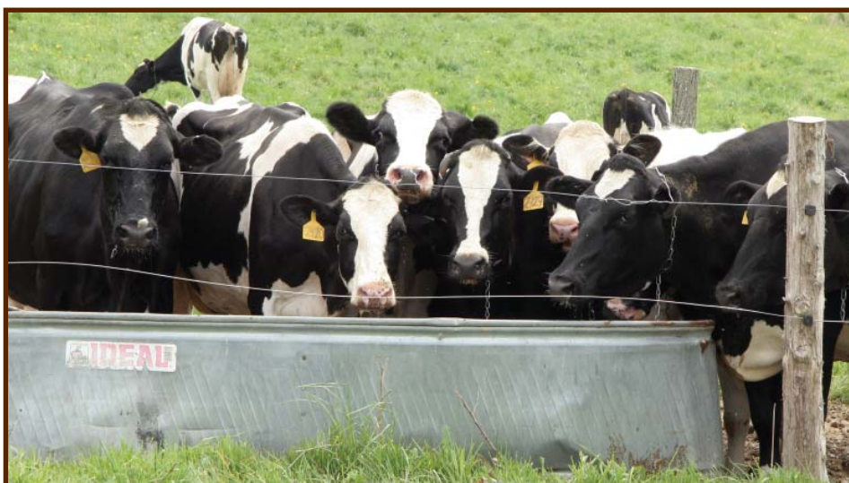
Water troughs provide a moist, nutrient-rich environment for bacterial survival, including the bacteria known to cause Johne's disease.

To inhibit the spread of MAP and exposure of susceptible animals to MAP on infected farms, best management practices aimed at maintaining biofilm-free trough surfaces should be included in any Johne's disease control plan.