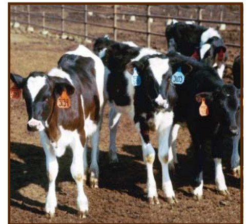
When expanding its herd, Moserdale Farm purchased calves only from known sources with known best management practices.

Editor's Note: This information is provided as a service to readers and is not intended as an endorsement of any product.