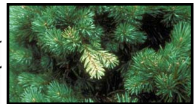
Damage caused by adult feeding