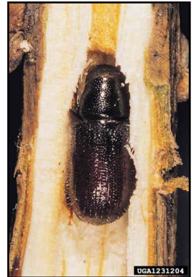
Adult boring through shoot