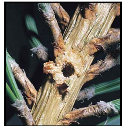
Entrance hole of adult in shoot