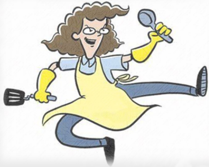
Jarrett J Krosoczka's 'Lunch Lady'