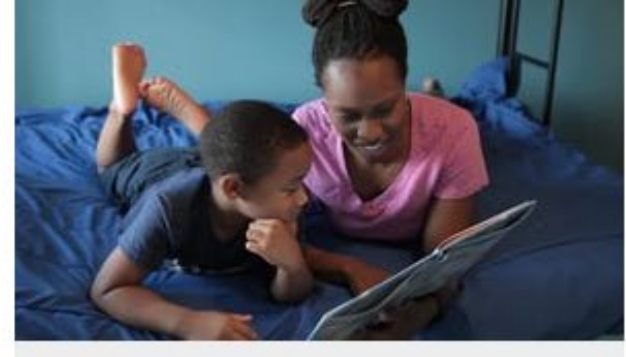
Reading Strategies: Look at the Picture