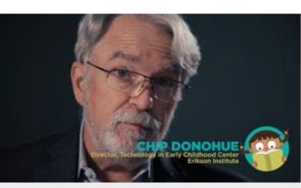
Tips for tech: Screen time battles

3-4 Years, 4-5 Years, Kindergarten, 1st grade, 2nd grade, 3rd grade, 18-36 months