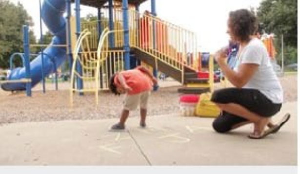
Stomp the Letter