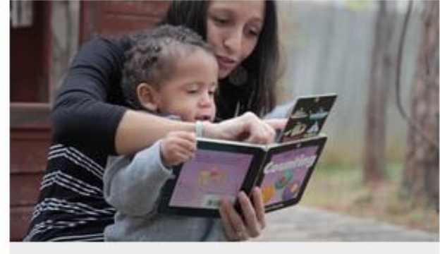
Reading Routines for Early Readers

0-9 months, 08-18 Months, 18-36 months, 3-4 Years, 4-5 Years, Kindergarten, 1st grade