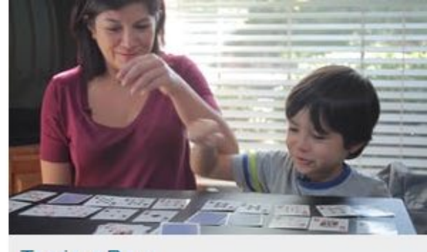
Ten in a Row