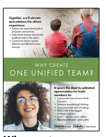
Why create one unified team flyer