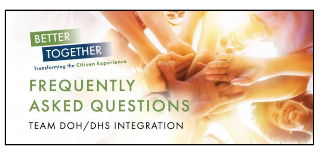
Manager talking points and frequently asked questions