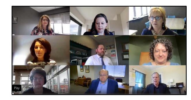
Leadership division overviews and team building