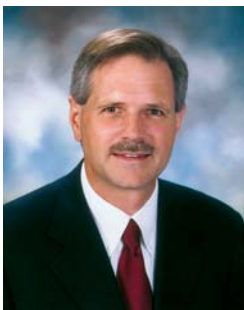
Governor John Hoeven